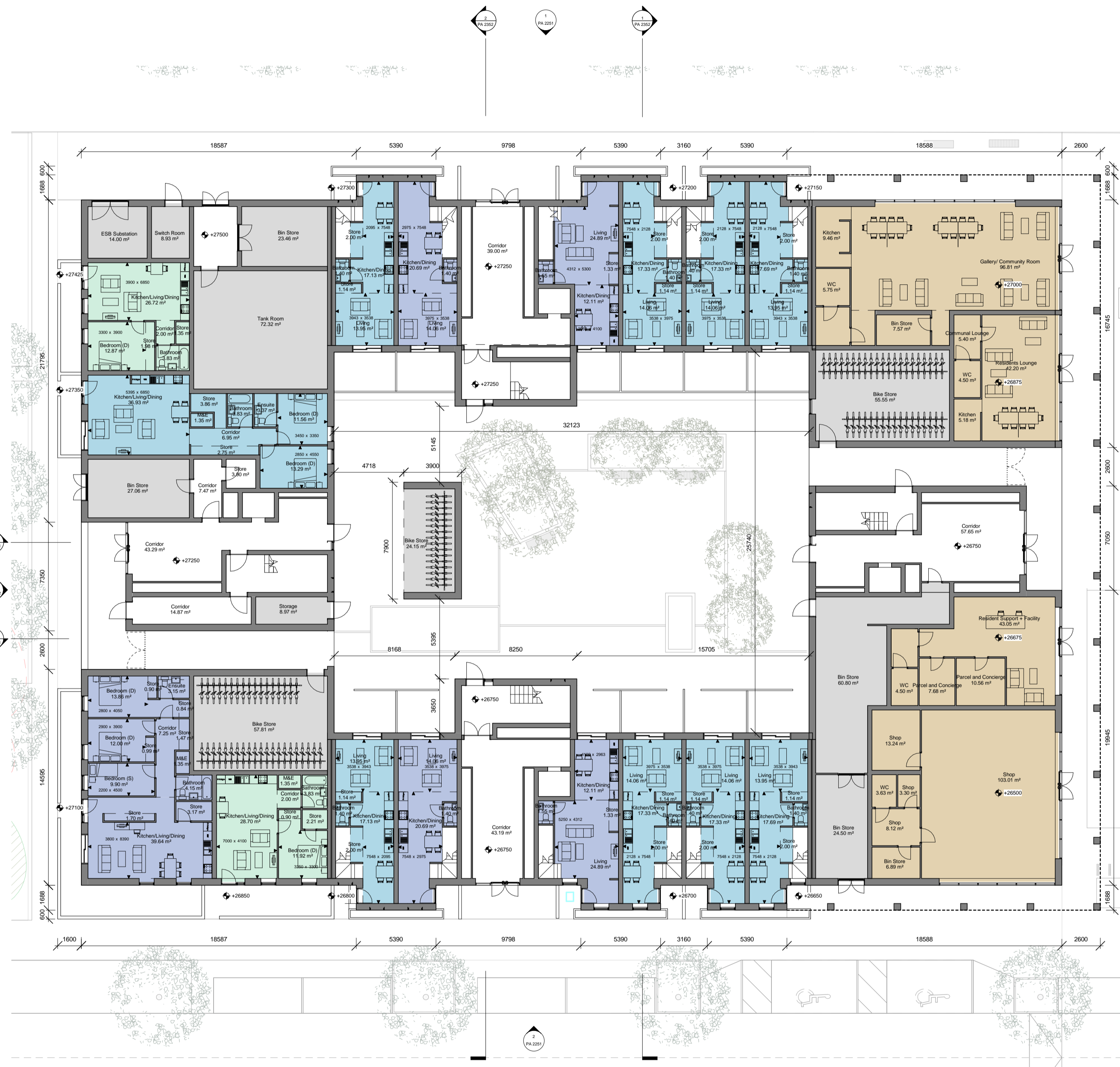
1 Block E - Level 00 1 : 200